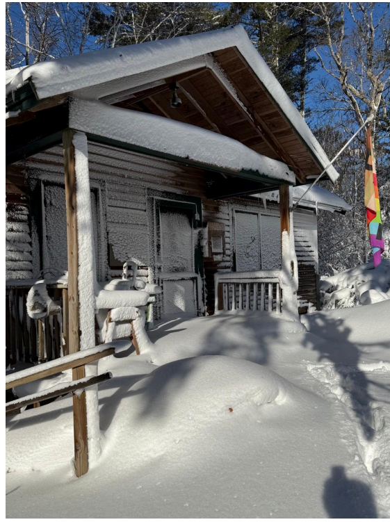
Pinewoods Office with the peace flag holding on.