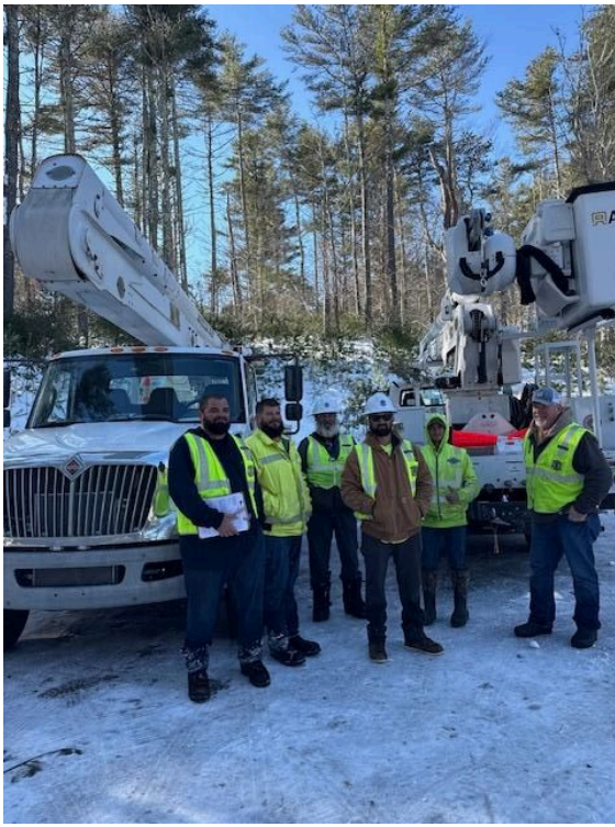
After 5 days without power, we were happy to see this crew of line technicians based out of Gainesville.