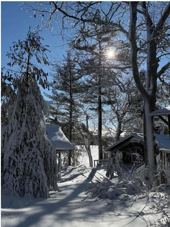
The sun peeking through the trees near Ampleforth.