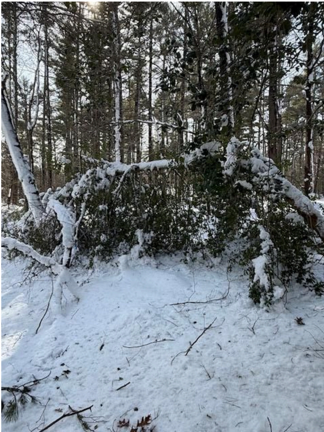
Our beautiful hollies were hit the hardest with the heavy snow.