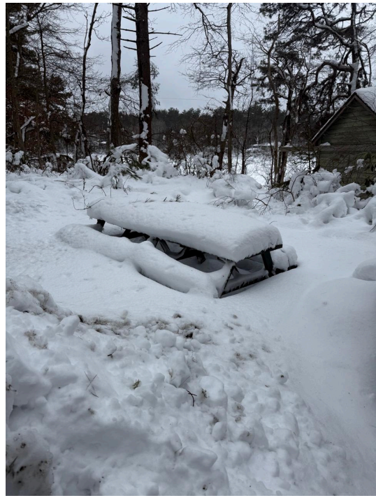
Measuring was nearly impossible due to the drifts. The Greeting Shed picnic table, pre and post storm.