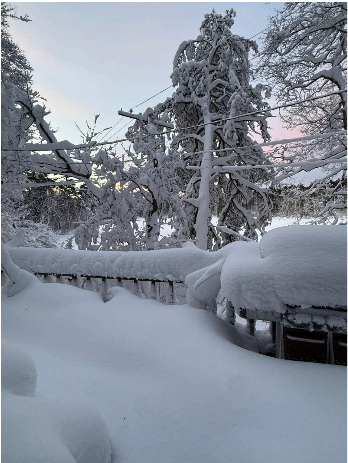
Tuesday morning after the blizzard brought a beautiful sunrise to Round Pond.