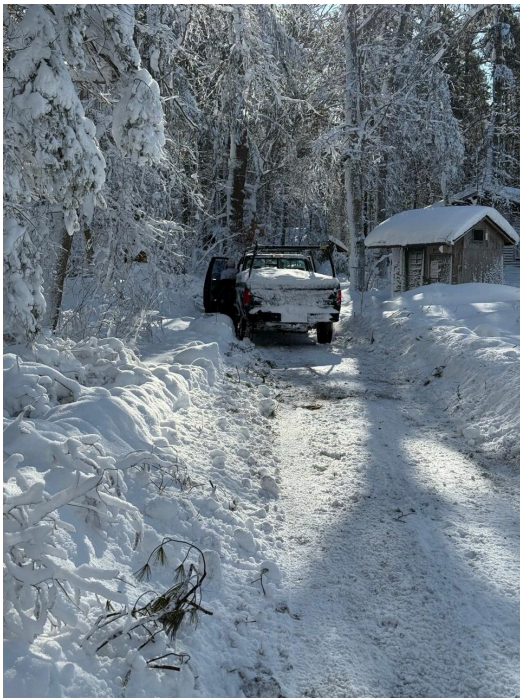
Camp's 1997 Ford F250HD on the job.