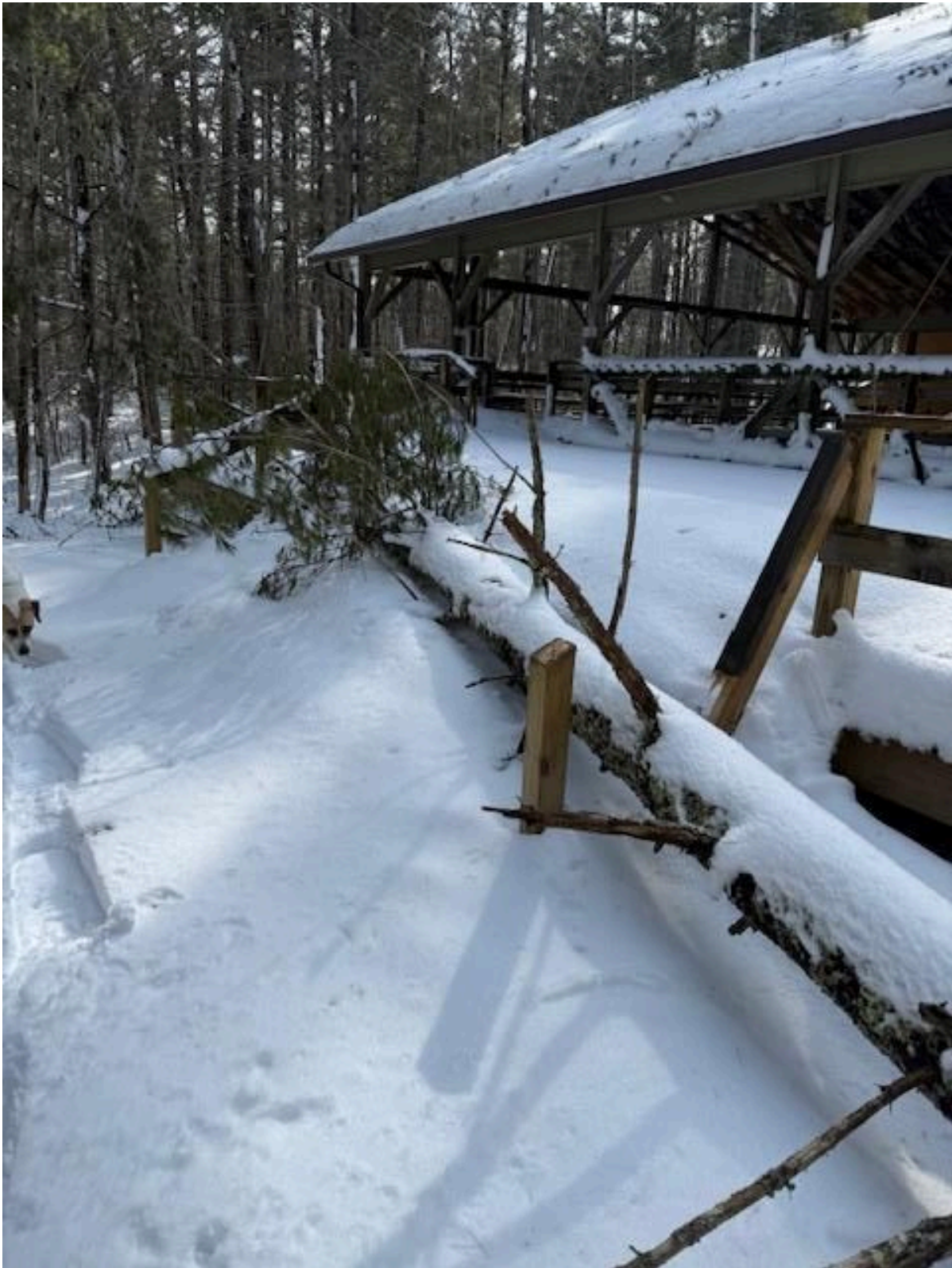
An uprooted white pine hit the deck and stairs of Hands Across.