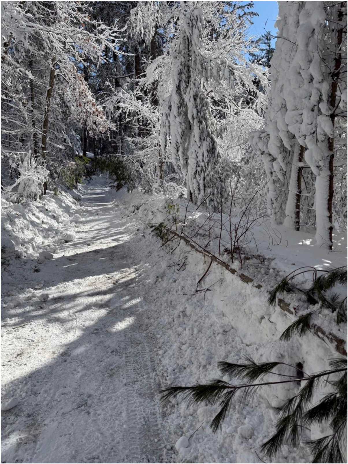
Plowed path to Pinecones, pine tree and all.