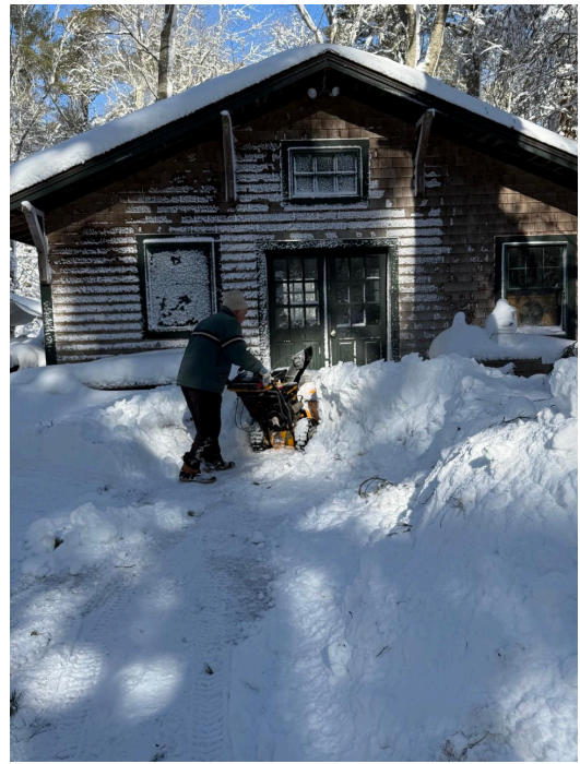
Dennis Carchedi digs out the Workshop.