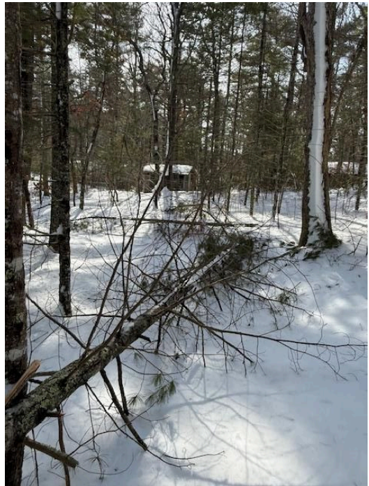
Downed trees block the path from the Camphouse to the Dining Hall.