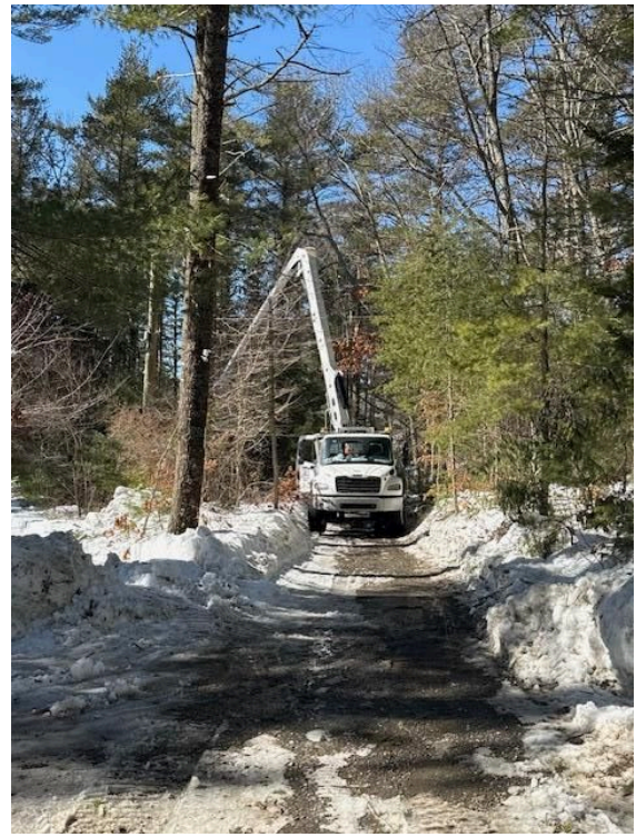
Line Techs repair wires between Hunsdon House and Pinecones, which also powers the well pump.