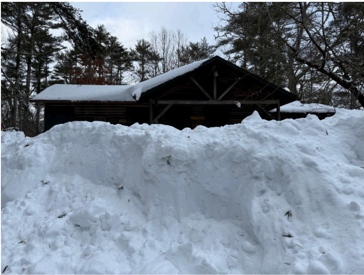
As New Englanders might say, "That's a wicked lot of snow!" Plowed snow pile in front of the Program Center.

On Tuesday the 24th neighbors came together to clear our familiar end of West Long Pond Rd, from Cornish Field Rd to Halfway Pond Rd. Once the trees and debris were removed, Dennis used the camp truck to plow a path. On Thursday, the town brought in a front end loader to clear the rest of West Long Pond Rd from Cornish Field Rd to Clark Rd.