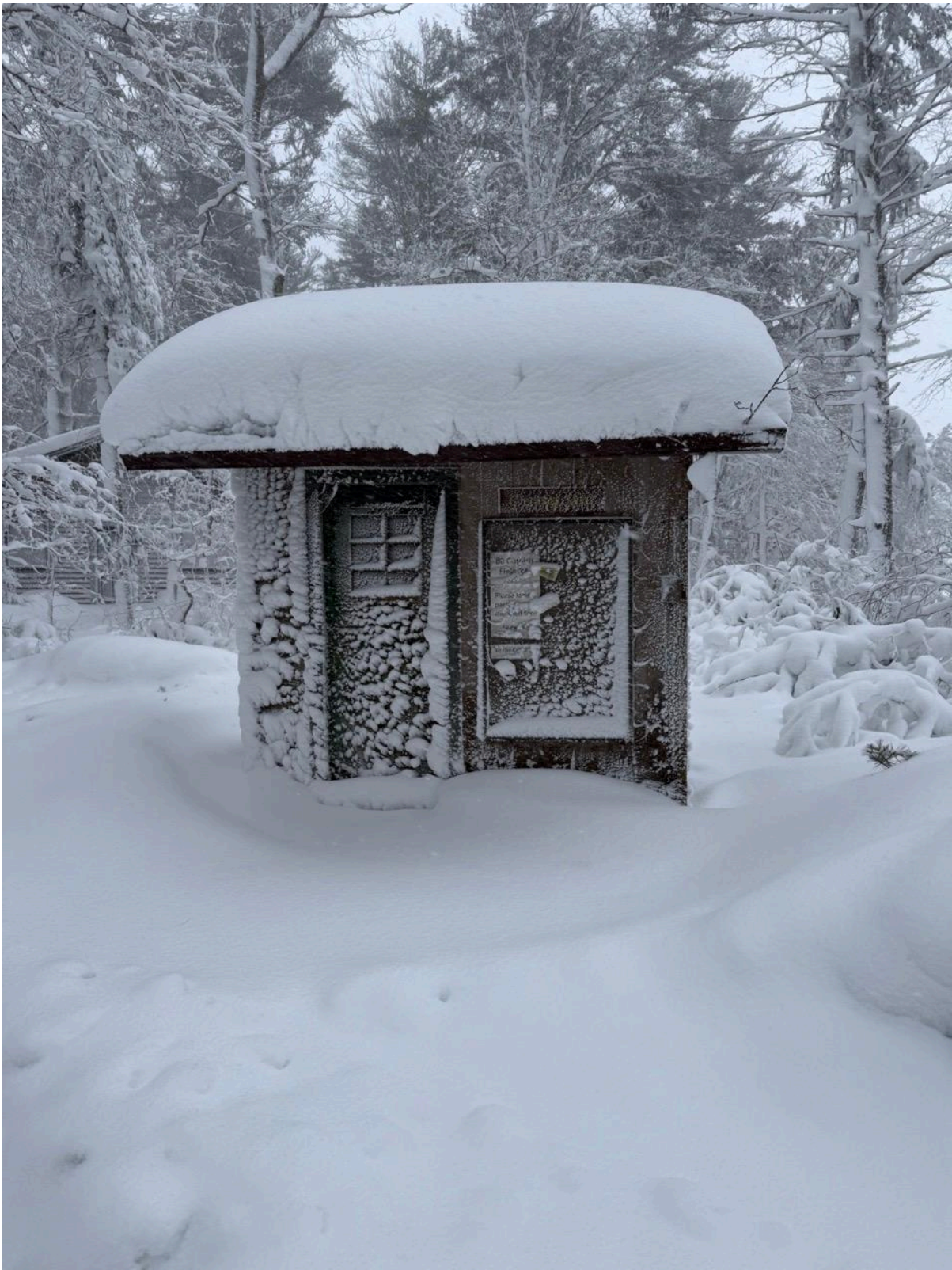
Greeting Shed - mid blizzard