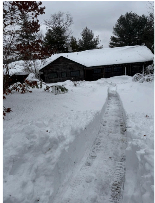
The path to the Kitchen.