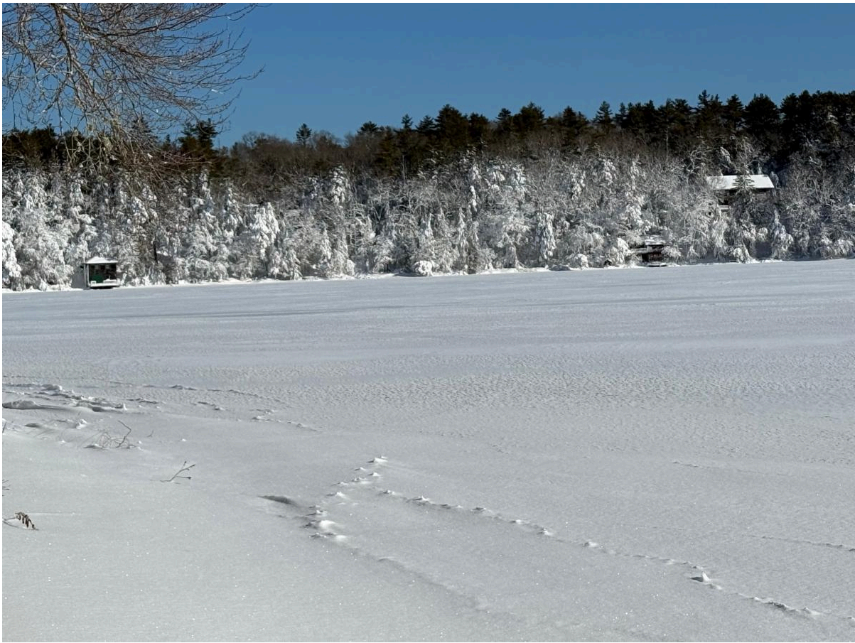
Looking across Long Pond from the water front below the Camphouse.