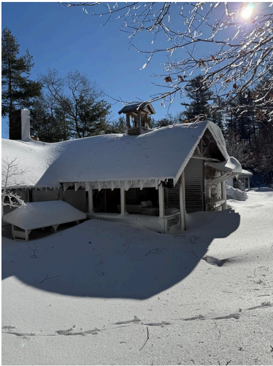
Dining Hall encrusted in snow.