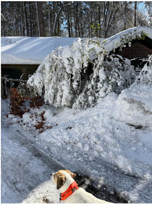
A downed oak and snow-laden holly block access to the Barn where the snowblower is stored.