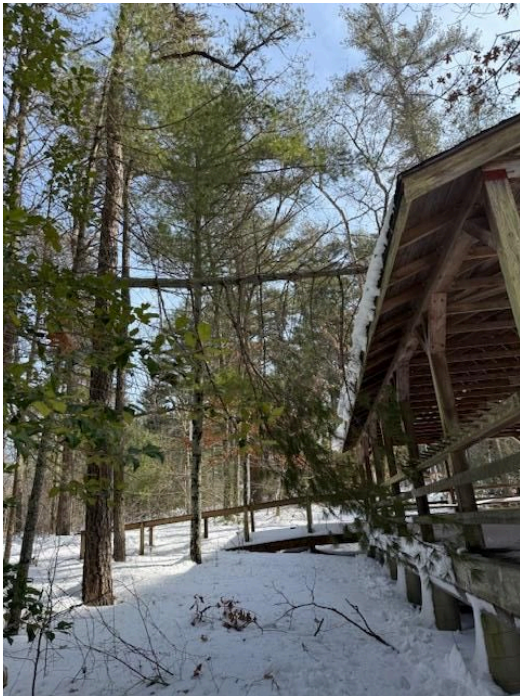
A small-ish tree on Newbiggin.