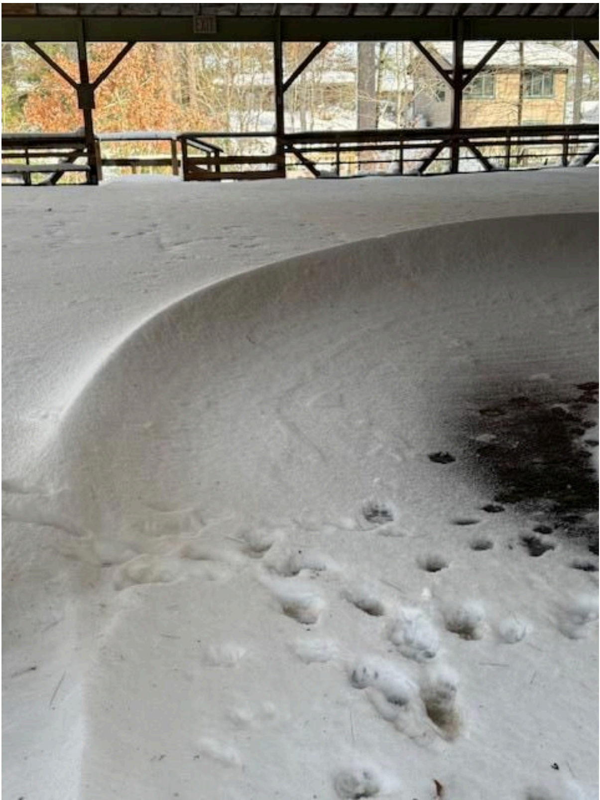
Snow drift in Hands Across; perhaps the name of a new song or dance?