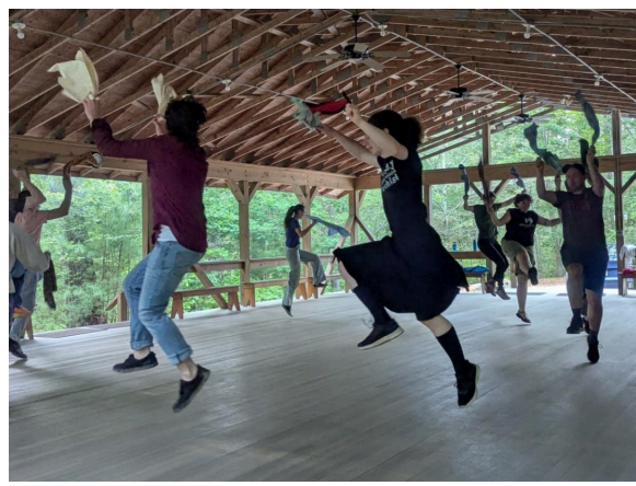
Crew Morris practice

Employment and Volunteer applications open in February, and we will be hiring folks for Kitchen and Grounds crews. Read about Crew on our website's Jobs page .