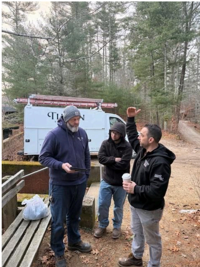
The Tilton Electric team getting ready to start the camp-wide assessment; Photo credit: Chris Jacobs

Part of our Strategic Plan is reviewing Camp's infrastructure, including water, sewer, and electrical systems. These assessments are needed to ensure the health and safety of campers and crew, preserve our rustic environment, and achieve our targets for efficiency and sustainability. Tilton Electric from Plymouth is beginning an assessment of our electrical systems, and the results will help guide our next steps in strengthening our infrastructure.