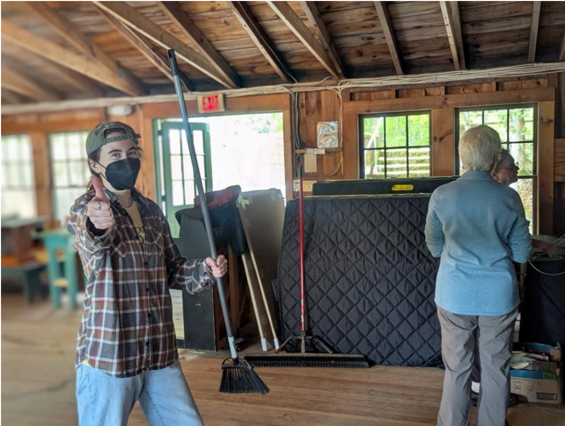
Opening the Camphouse, Memorial Day Work Weekend 2025; Photo credit: Beth Reagan

Spring Work Weekends will be May 16-17 and May 23-25, 2026. Help us open Camp by unpacking and sprucing things up as you enjoy a more intimate version of Pinewoods. Check out our website and stay tuned for registration.