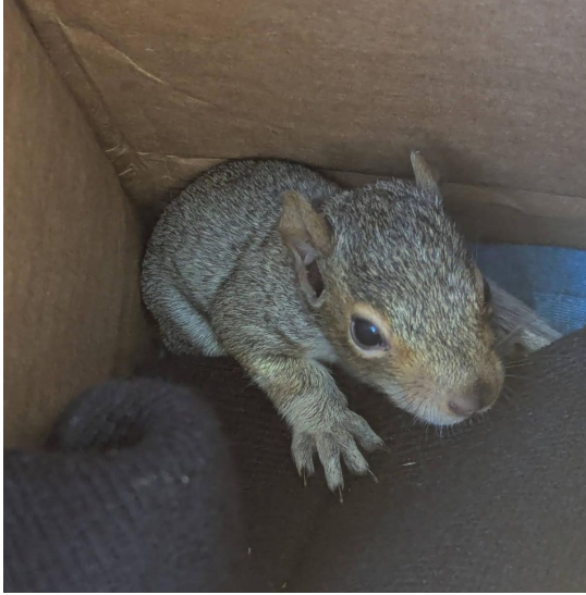
Boxed & ready with Pinewoods merch bedding