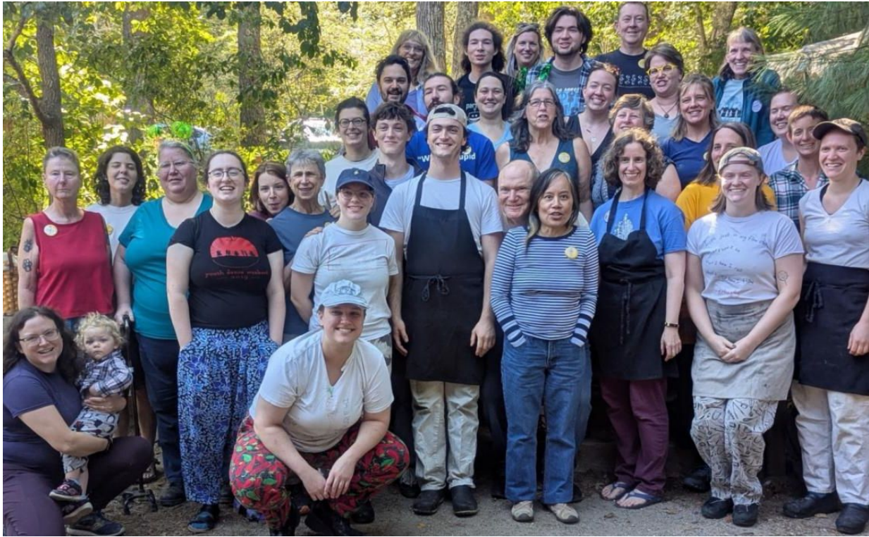
Past, present, and future Kitchen Aides, a legacy of camaraderie and fantastic food

takes respite in each other's company, whether it's a bagel-making party, Kitchen Olympics, or a debutante ball with gowns made from available materials (think tin foil or bubble wrap). Being on Crew together forges a bond that can last a lifetime.