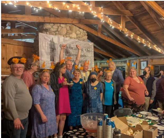
1980s Crew, First Night After-Party in the Camphouse

Between 12 and 14 September, 2025, we came out of the shadows and took over Camp for the first ever Crew reunion, part of the Pinewoods Centennial celebration. Over 100 current and past crew members gathered to savor old and new friendships, share dances and songs, and help close Pinewoods for the winter.