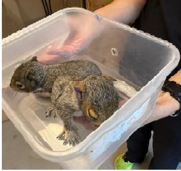
The kits, placed in a Tupperware and given a temporary marking for differentiation at the Wildlife Center