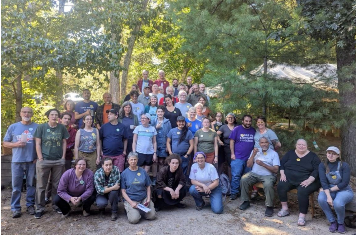
Grounds Crew makes Camp go round, and they have a good time doing it

Administrative Crew - Office Staff and Camp Managers have had many incarnations through the years