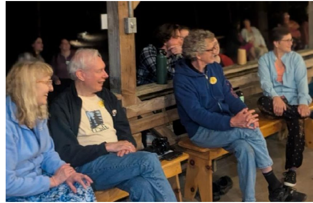
Enjoying the Evening Dance in Hands Across