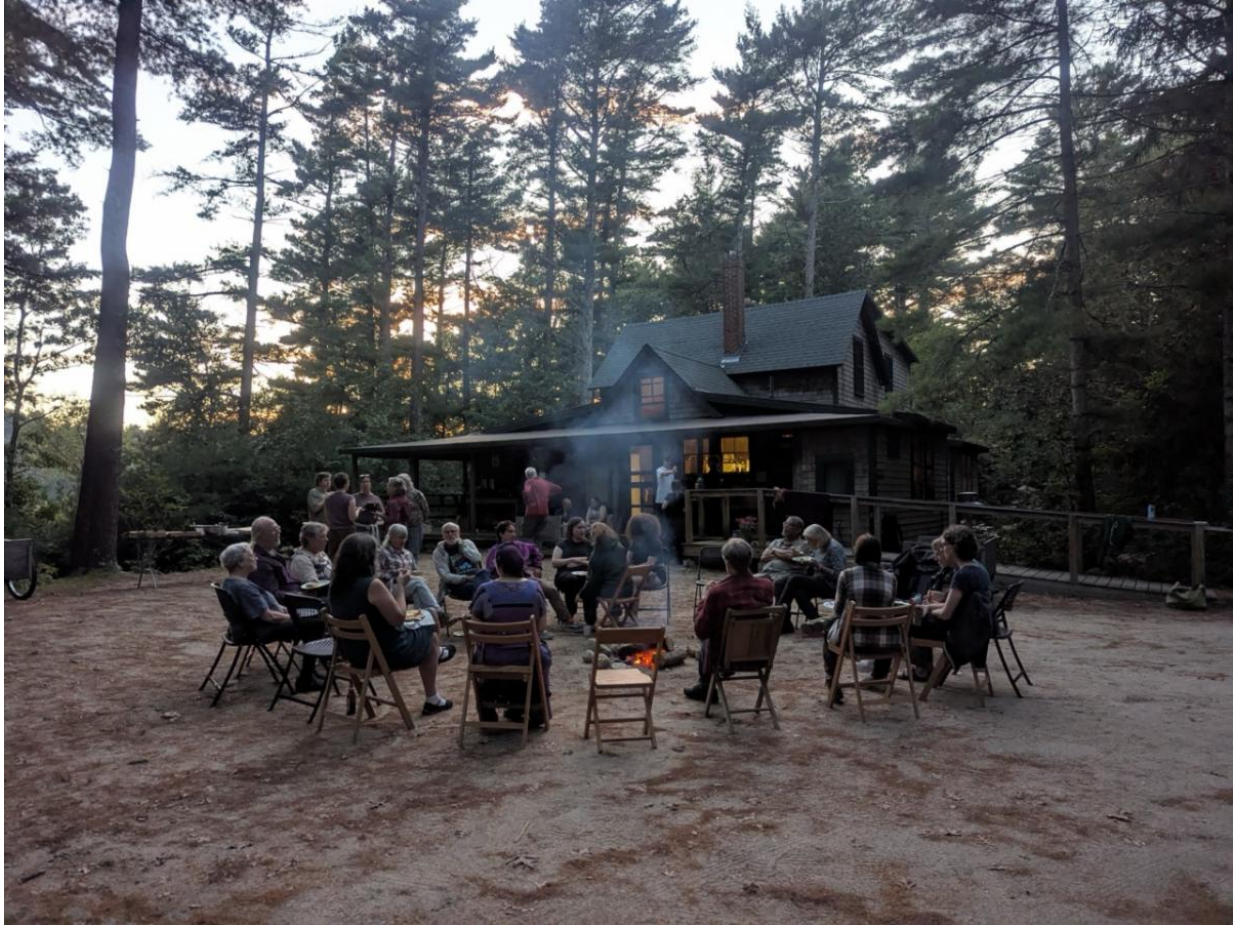
Sunday evening Crew and Volunteer dinner around the fire outside Pinecones at sunset