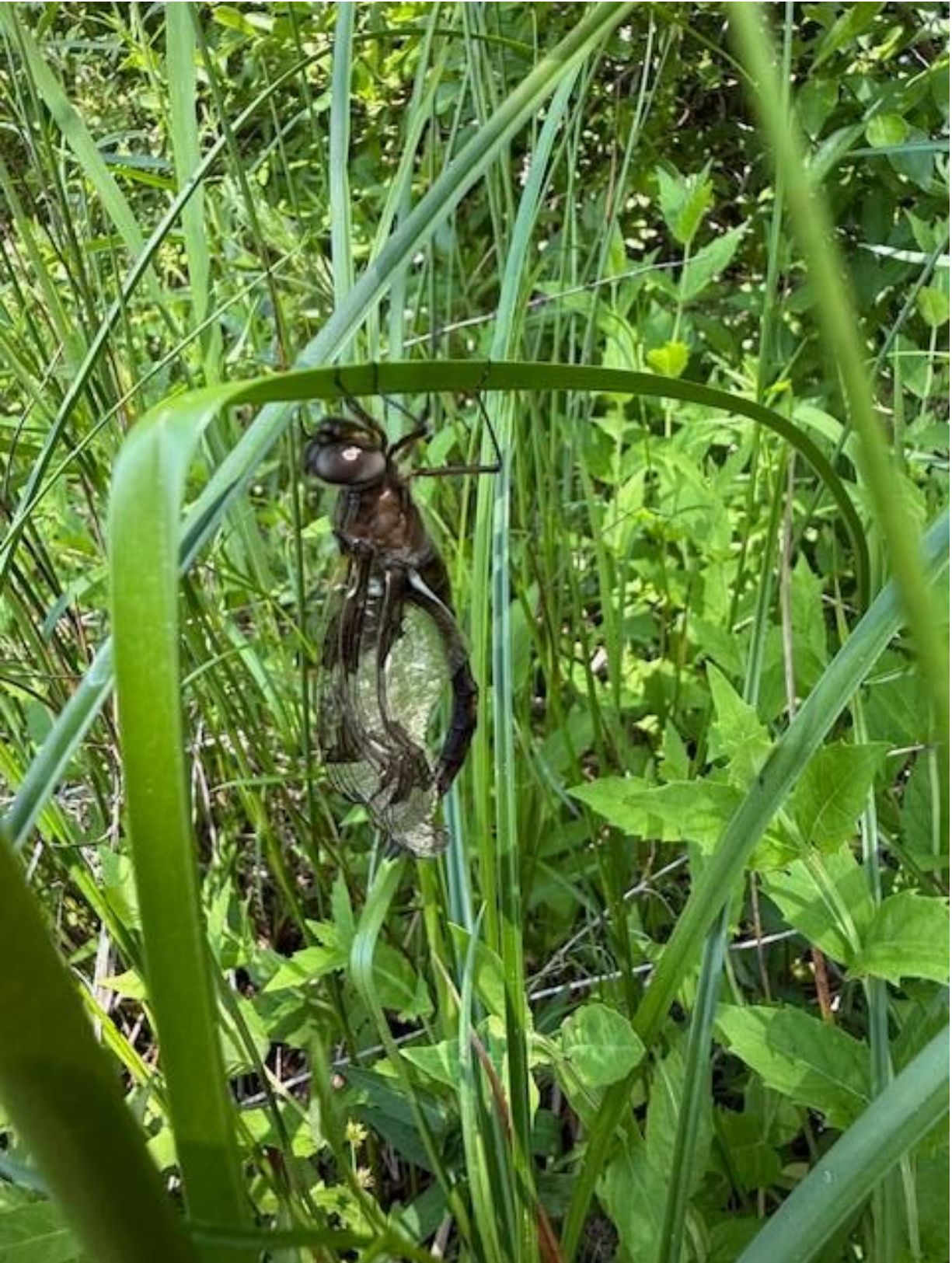
A Round Pond dragonfly unfurls its wings (bottom) after emerging from its exuvia (top).