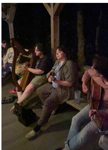
Crew members play for a Crew waltz party.