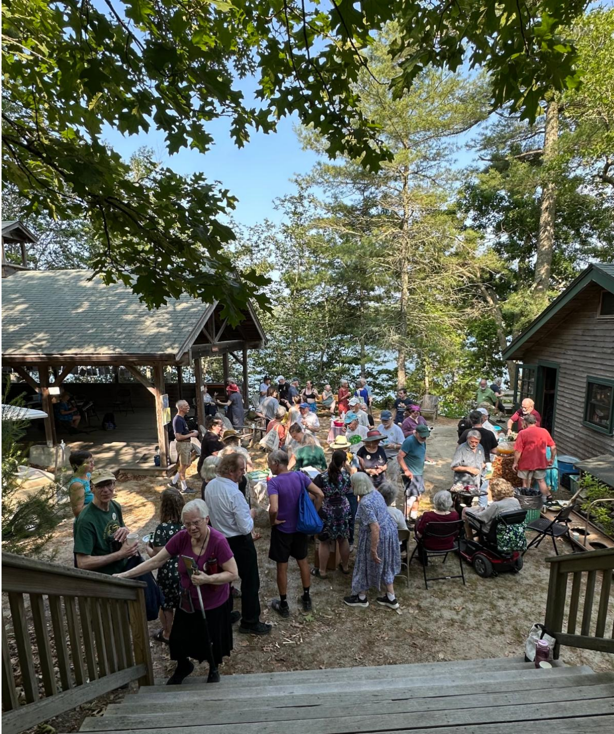
Pinewoods "Birthday Party" Celebration