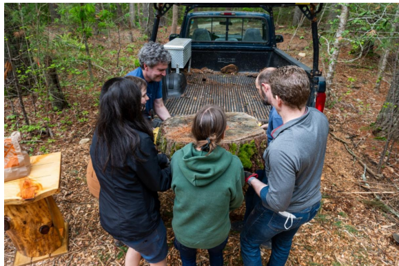
Moving felled tree trunk pieces; digging trenches for run off and erosion control; team lifting a slice of tree for the Nature Nook.