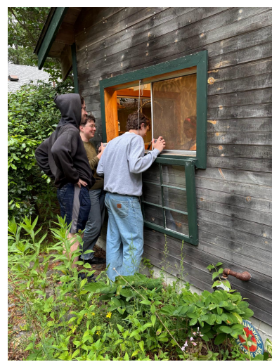
Visiting Pots.