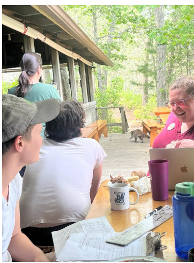
Mayhem visits a Crew meeting.