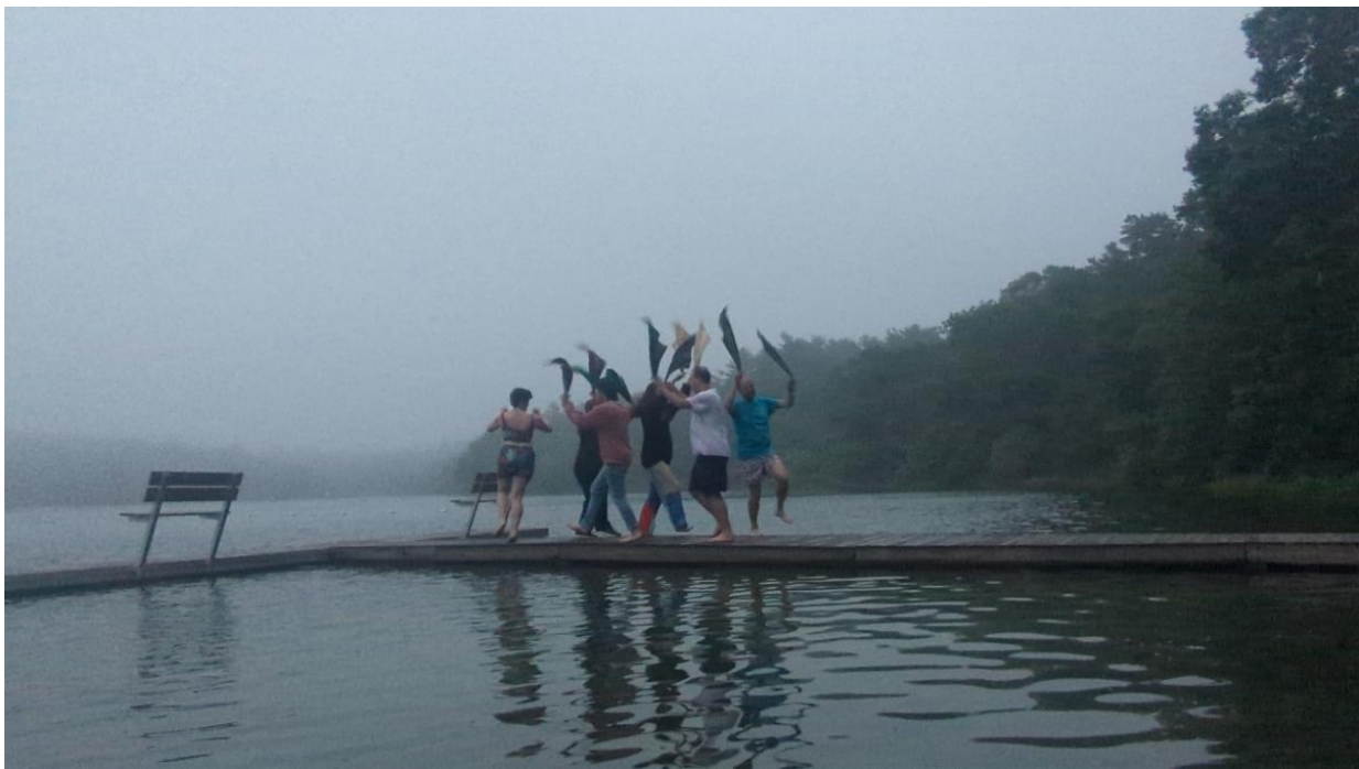
Crew celebrates the solstice by "dancing up the sun" on the last day before campers arrive, using hankies donated to Crew by Kimberly Field.