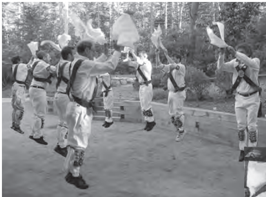
Congratulations to America's oldest morris team, the Pinewoods Morris Men, founded at camp in 1964. On to the next 50 years!