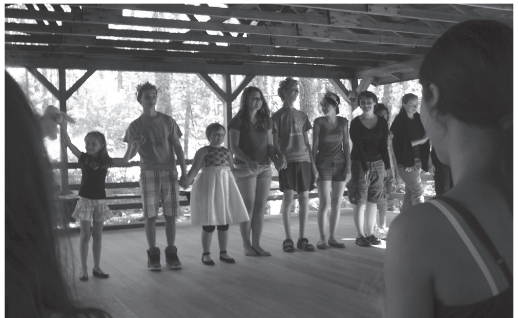
Shakespeare in a Box, Labor Day Weekend.