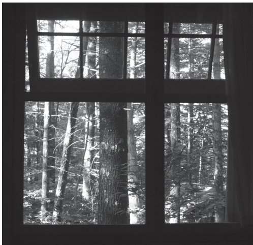
View from inside the Betsy cabin.