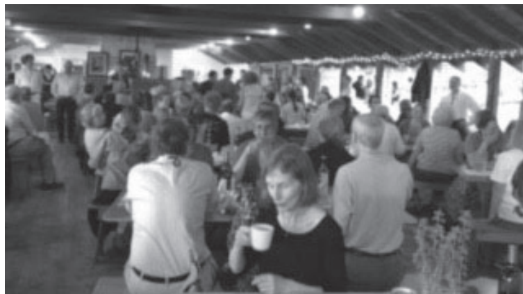
Twenty Tables of Eight Gala Celebration 2012.

In mid-September our camp season was brought to a close very smoothly, especially when compared to last year's ending. A record number of work weekend volunteers helped us pack up and prepare for winter in an impressively short time. I love our volunteers and the amazing enthusiasm they bring to camp every year. They bolster the by-then rather tired crew-members and inspire everyone onward to the finish line.