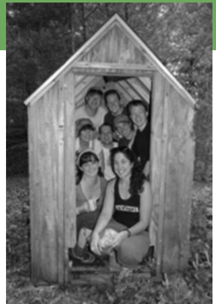
Work Weekenders -- "The Scottish Horde" at Spring 2012 Work Weekend.