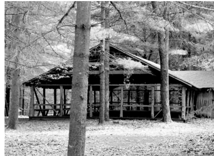
C# as it was in the 1960s

structure (when adults were not looking!) For the dancers, it may not have been quite so magical. It had only about 60% of the floor area we're used to having nowadays. The band-shell was small, dark, and had poor acoustics. By the 1970s its smallness and the rot caused by its resting on the ground had made it clear that change must soon come.