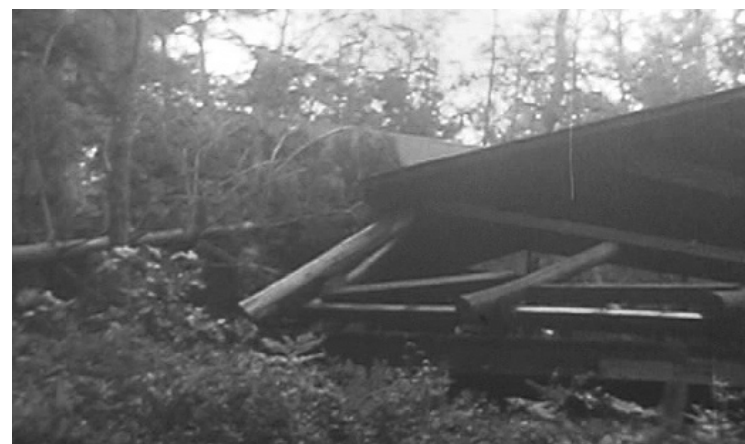
C#-I after the hurricane of 1938