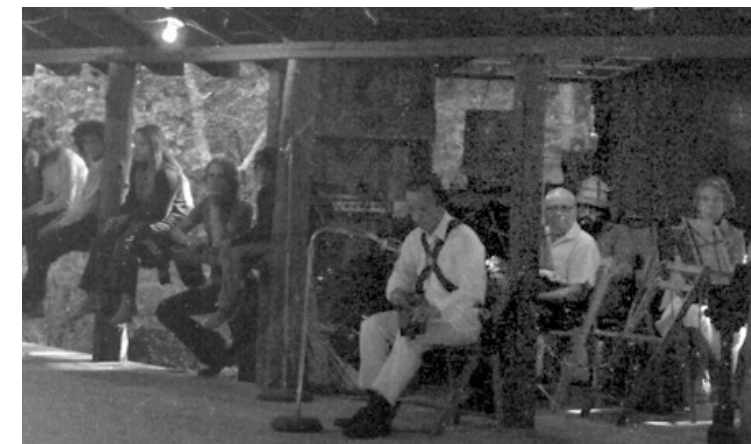
Interior and old band-shell C#-II