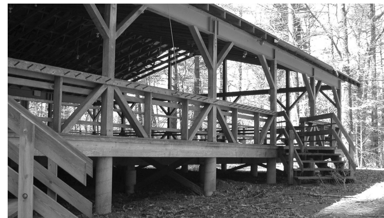
C# as it looks today.