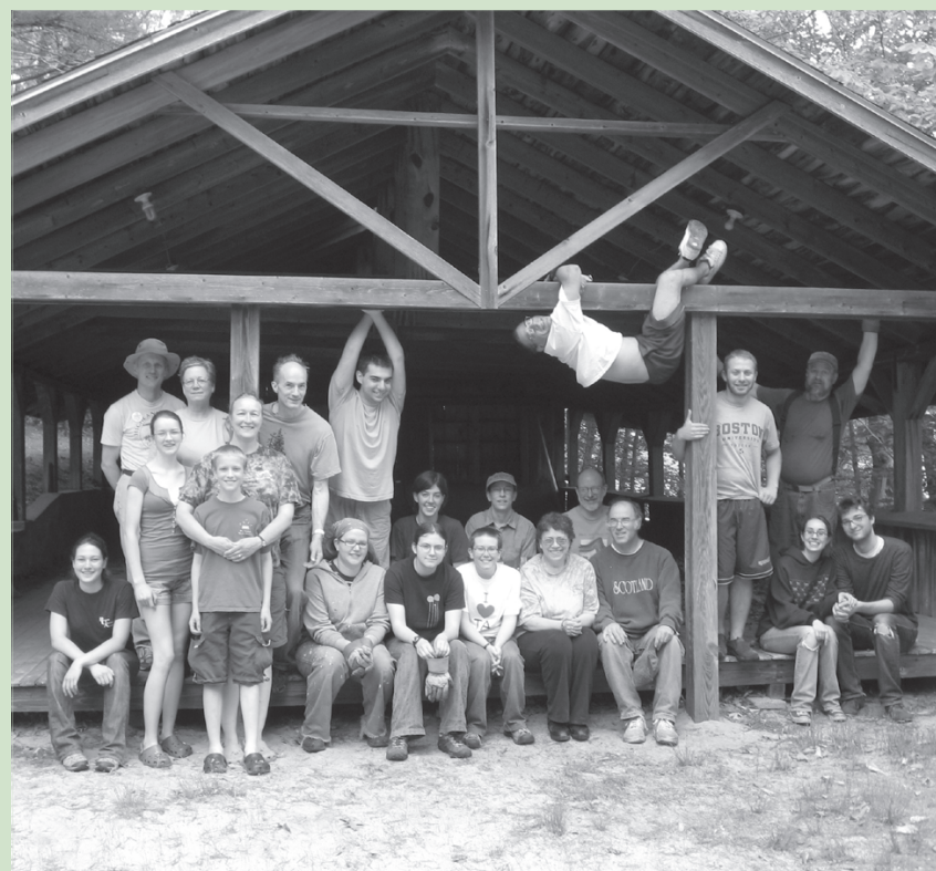
Spring 2008 Work weekend volunteers gather in front of Ampleforth after removing the docks from their winter storage place for the last time.