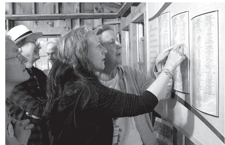
Campers perusing the plaque July 4th weekend unveiling.